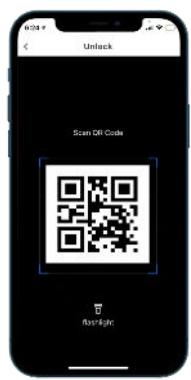
Scan QR code