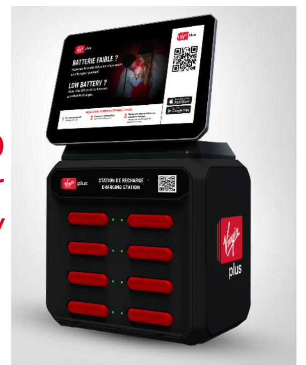
8 portable chargers