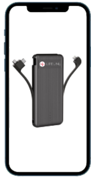
Unlock and grab a portable charger